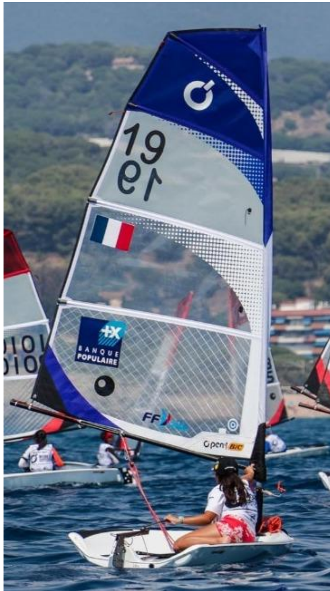
Fig 2 – Sail diagram