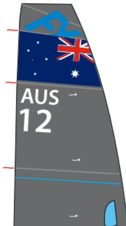
Mainsail Flag Location